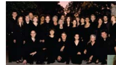
CHICAGO CHORAL ARTISTS

Chicago Choral Artists, a 36-member ensemble that has offered truly beautiful music to Chicago audiences for over 35 years, will present Reaping the Bounty: Caring For the Earth, Caring for Each Other , a concert honoring Earth Day and telling of the labor that goes into caring for the earth and for each other.